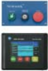
SW 5000 Control Panel with PV 600 user interface

The simple yet well-proven design, coupled with 'state of the art' programming makes the Scientek SW 5000 series washers the right choice of washer for your facility.