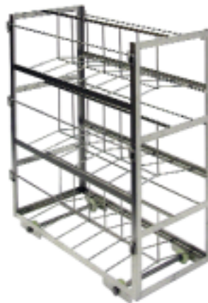
SMR-55 Cage Rack (two per load with vertical header)