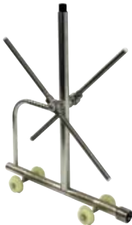
SMR-55 Vertical Header (used between cage racks)