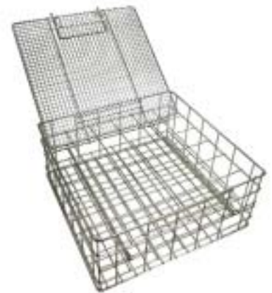
BB-36 36 Bottle Capacity Basket (multiple basket options available)