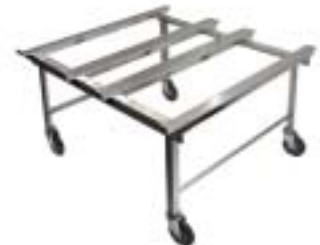
TT-55 Transfer Table (mobile header storage)