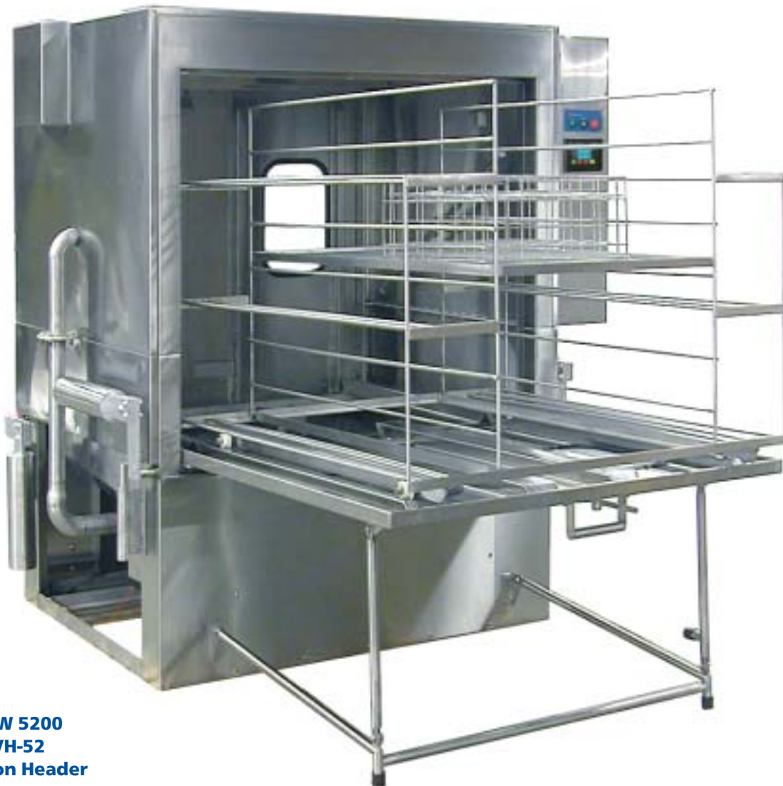
Model SW 5200 c/w CVH-52 Combination Header